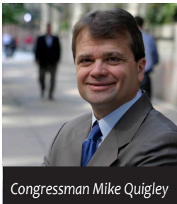
Congressman Mike Quigley