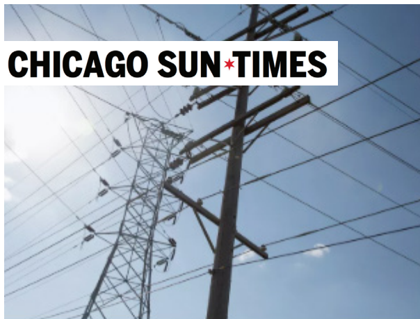
Energy Progress Act and the Clean Energy Jobs Act would lead to unnecessarily higher electricity bills, according to the Illinois Chamber of Commerce.

...t the summer and into the fall, the nuclear industry and like-minded advocates are urging the passage of massive legislation that would implement aggressive changes to Illinois' energy economy — with costly impacts to energy consumers.