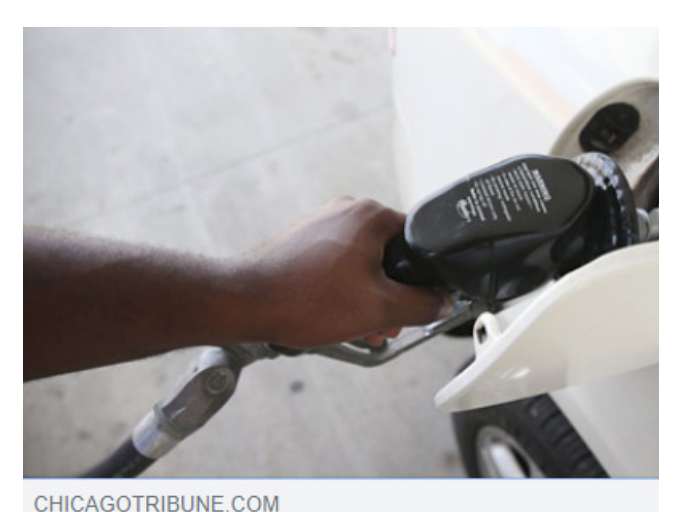
Commentary: Why the gas tax is good for Illinois businesses

-Tyler Diers on data centers, Center Square