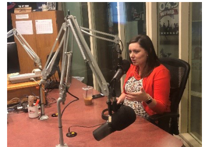
State Representative Avery Bourne